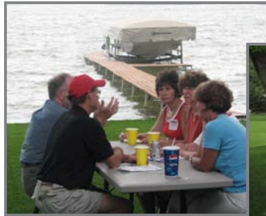
Above: Members of the Health Science breakout group discuss various creative ideas to stimulate youth interest in pursuing medical careers that are poised for growth here in Dawson County.