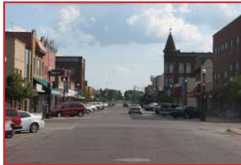
Washington Street - Downtown Lexington

LINCOLN, NEB. (July-2007) - Lexington has earned the Nebraska Economic Development Certified Community designation. The state's other certified communities are Auburn, Fremont, Grand Island, Holdrege, Nebraska City, Norfolk, North Platte, Ogallala, Ord, and South Sioux City.