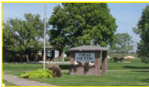
Cozad Country Club - 100 Country Club Road

We would like to thank all those who attended the event. The golf tournament included 16 teams and the pitch tournament included 6 players. There were a total of 89 steak dinners served. The 2008 Business and Industry Appreciation Day will be held at Lakeside Country Club on Johnson Lake.